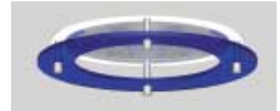
Single cobalt blue glass ring with open center — KDR81GC