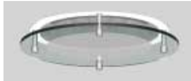
Single soda lime glass ring with frosted center — KDR81SL