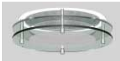
One clear soda lime glass ring and one frosted glass ring — KDR82GL-SL