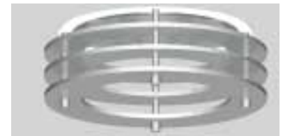
Three aluminum rings – clear stain finish — KDR83AA-AA-AA